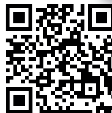
Scan to access to our website