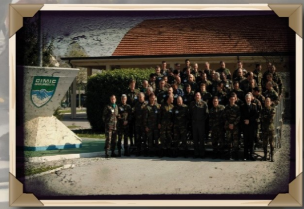
2005 NATO Tactical CIMIC Course