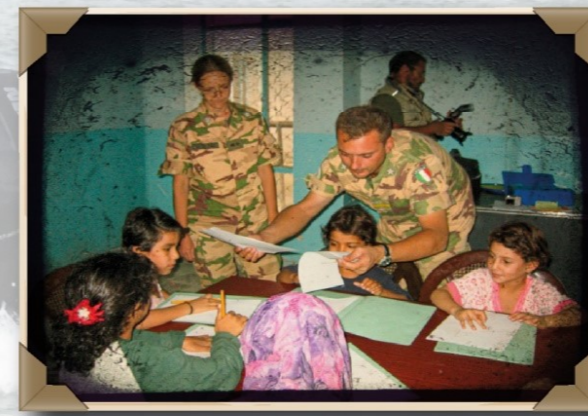
2003 First activities of CIMIC operators in Iraq