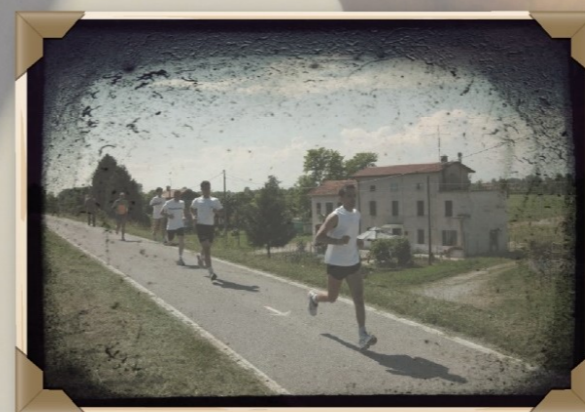
2006 1 st CIMIC Fun Run