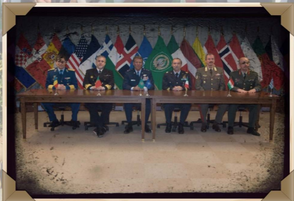
2004 Signing of the first Memorandum of Understanding