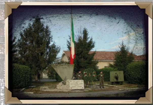
2003 The old flagpole

A very important symbol of the unit is represented by the historic building of “Villa Veneta”. The building, which was the first of the current military complex, is the residual part of the palace “Condulmer” (XVIII sec.), which was one of the biggest palaces in Motta di Livenza. The central body was located where the Livenza river flows nowadays, just upstream of the walkway, in line with the outliving building. The whole palace was surrounded by high walls, topped with statues and closed by large and beautiful iron gates.