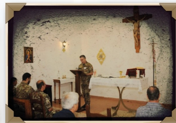
MNCG Chapel during one of the first ceremony