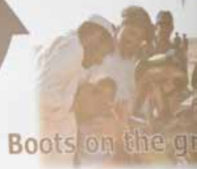
Boots on the ground